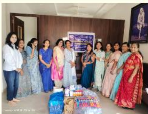
IWC AHMEDNAGAR DONATED ESSENTIALS ITEMS WORTH RS 20,000/- TO MENTALLY CHALLENGED PEOPLE