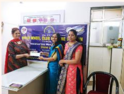
IWC PUNE UPTOWN DONATED 5000/- TO CANCER PATIENT