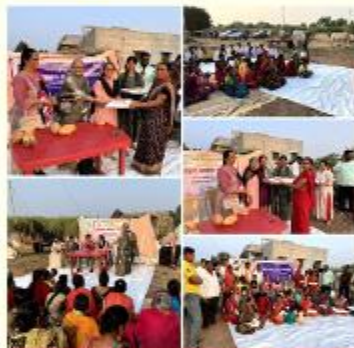
IWC SHEGAON DISTRIBUTED SWEETS AND SAREES TO 50 WOMEN WORTH RS 25000/-