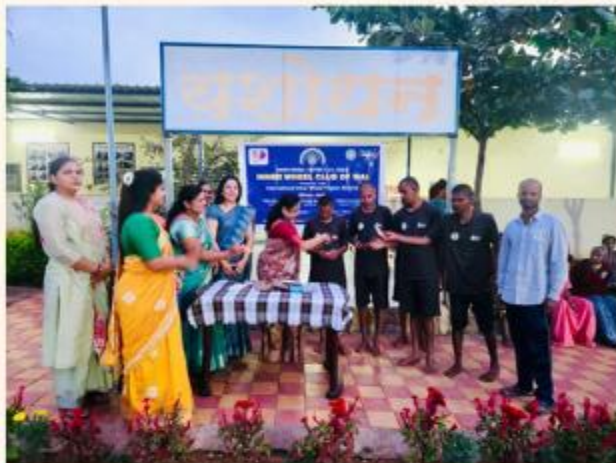
IWC WAI DONATED GENERAL MEDICINES TO YASHODHAN AASHRAM WORTH RS 3500/-