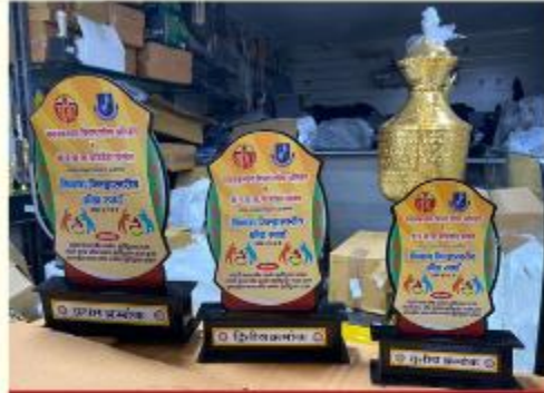
PANVEL INDUSTRIAL TOWN