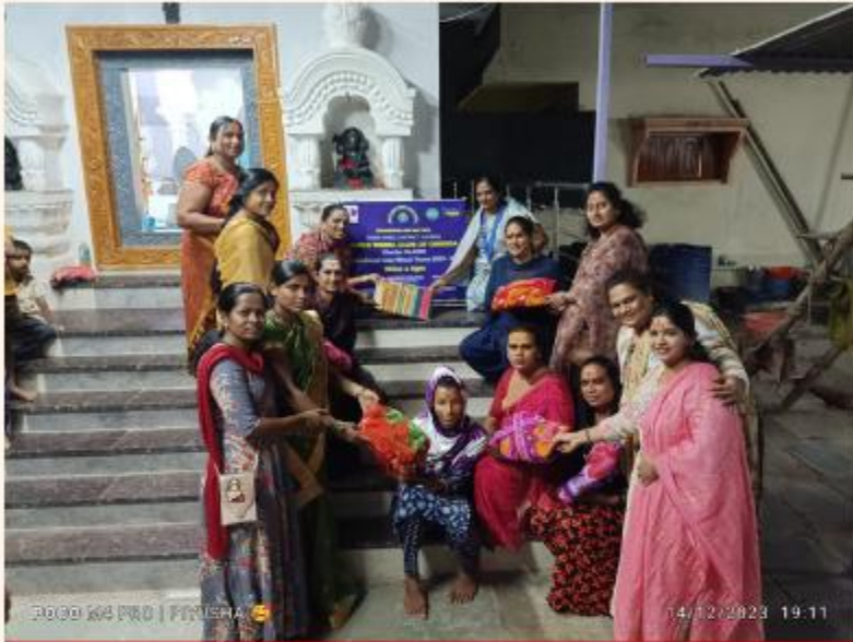
IWC OMERGA DONATED CARPET AND BLANKETS TO TRANSGENDERS