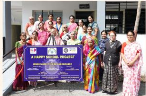
IWC AURANGABAD 3RD SCHOOL - 12,79,575/-