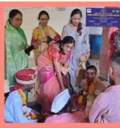
IWC POONA NORTH ARRANGED A MARRIAGE OF POOR GIRL WORTH RS 50,000/-