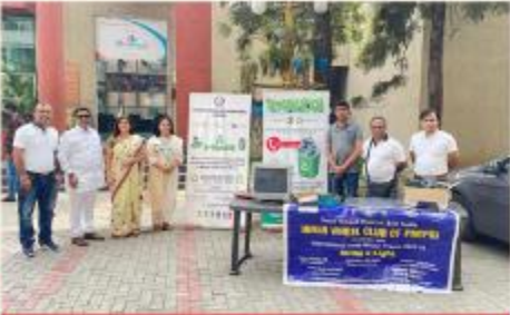
IWC PIMPRI COLLECTED E- WASTE AND SENT IT FOR RECYCLE WORTH RS 21000/-