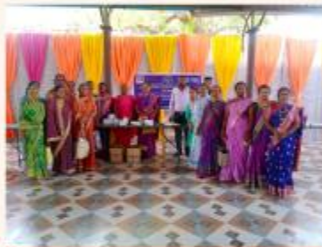
IWC MANGALWEDHA CONDUCTED OSTEOPATHY CAMP WORTH RS 10,000/-