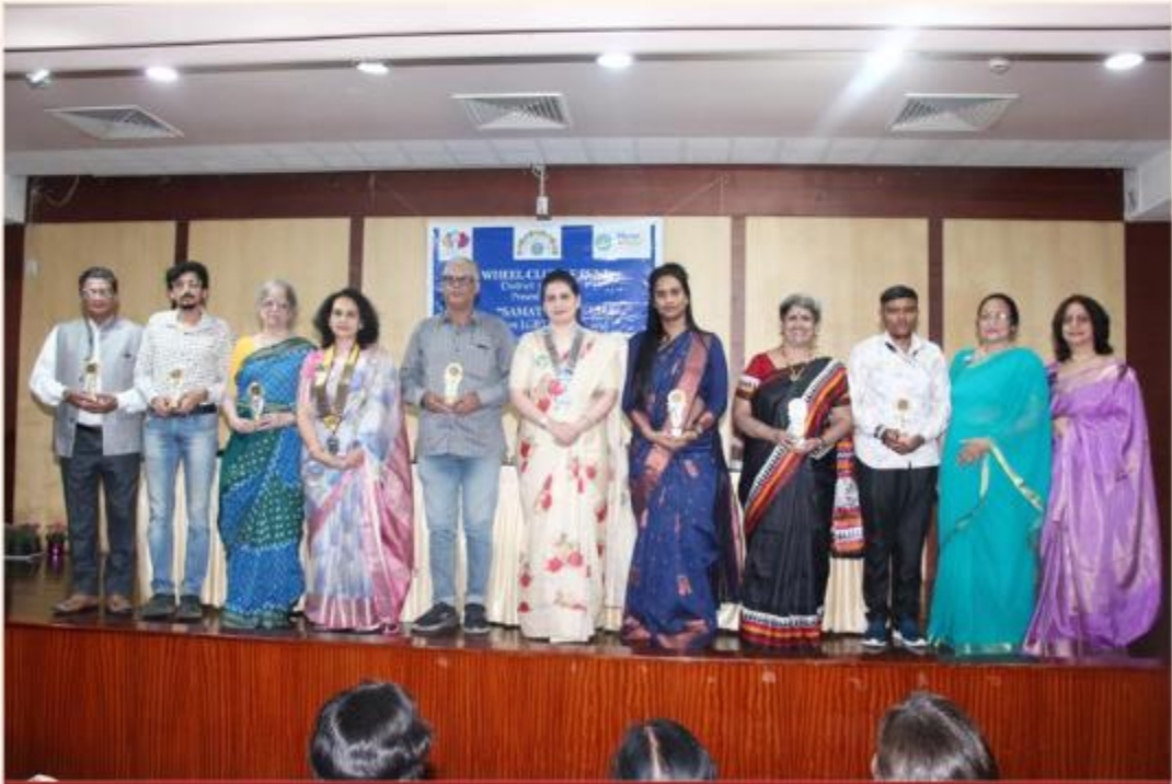
IWC PUNE ARRANGED LECTURE ON SYMPOSIUM ON LGBTIQ ISSUES AND GENDER EQUALITY WORTH RS 20000/-