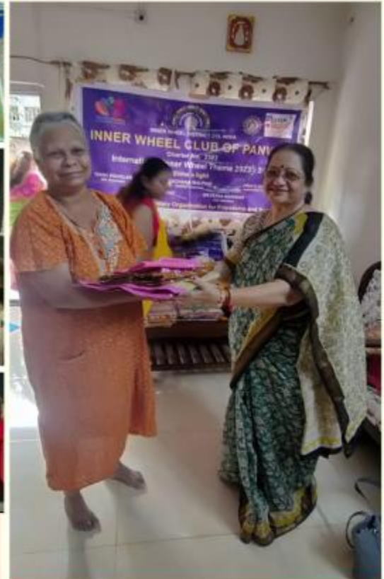
IWC PANVEL DONATED ESSENTIAL ITEMS TO SENIOR CITIZENS WORTH RS 10,210/-