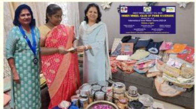
IWC PUNE RIVERSIDE DONATED ESSENTIALS ITEMS TO BLIND COUPLE'S DAUGHTER MARRIAGE WORTH RS 45,000/-