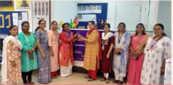
IWC AURANGABAD LOTUS ORGANISED BEST OUT OF WASTE WORKSHOP