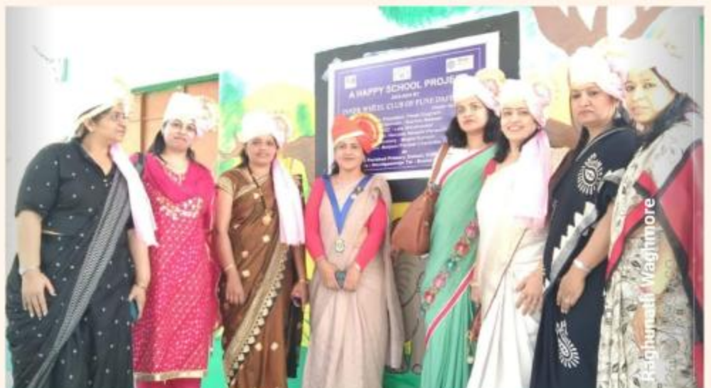
IWC PUNE DEFFODILS - RS 93,900/-