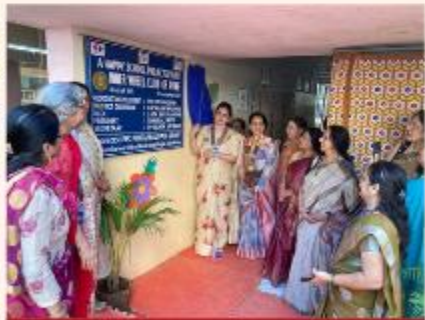
IWC PUNE 3RD HAPPY SCHOOL- RS 87,500/-