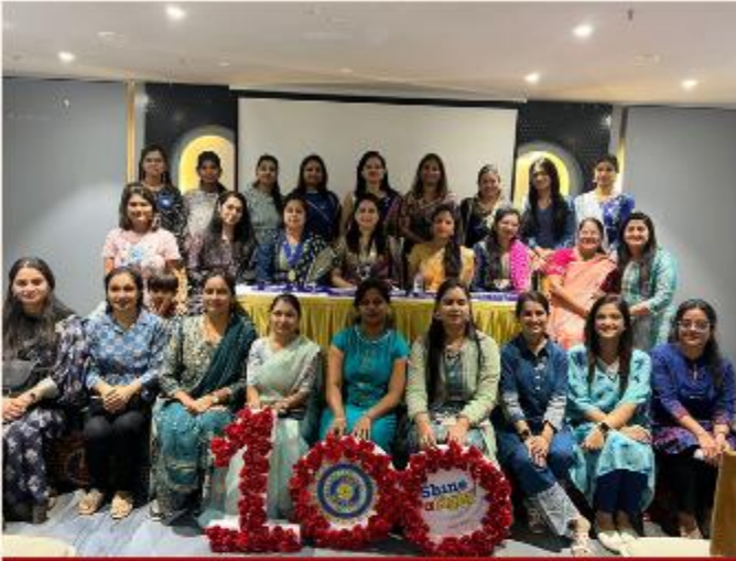
IWC AREA 24 LATUR