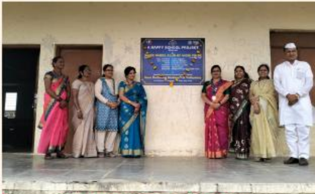
IWC NIGDI PRIDE 4TH SCHOOL - 1,36,512/-