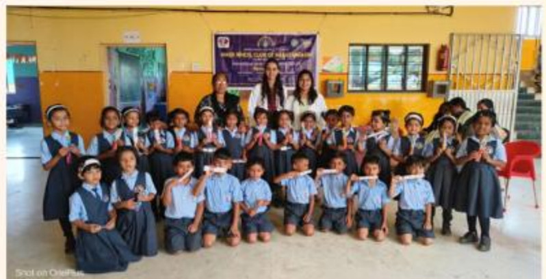
IWC NARAYANGOAN CONDUCTED DENTAL CHECKUP FOR 275 STUDENTS WORTH RS 3150/-