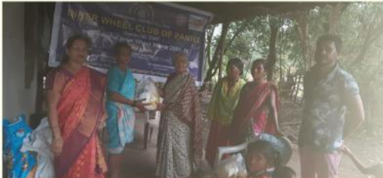
IWC PANVEL DONATED GROCERIES TO AADIVASI FAMILIES WORTH RS 11,381/-