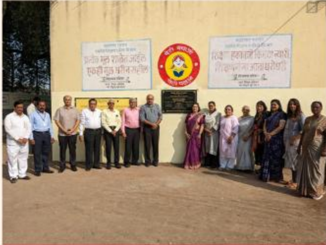
IWC SOLAPUR - 2,70,000/-