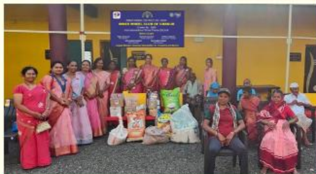
IWC CHAKUR DONATED GROCERIES WORTH RS 10,000/- TO OLD AGE HOME