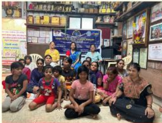
IWC TALEGOAN DABHADE DONATED GROCERIES WORTH RS 5000/- TO DIFFERENTLY ABLED CHILDREN