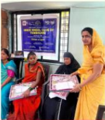
IWC TEMBHURNI DISTRIBUTED SAREES ,FOOD WORTH RS 24,700/-