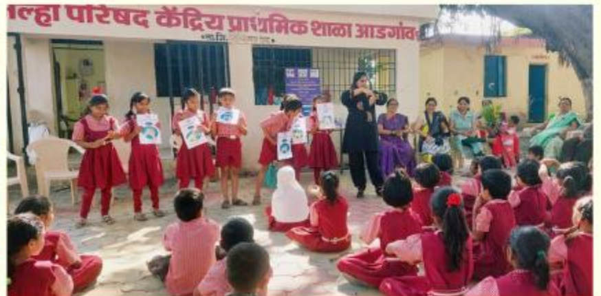
IWC AURANGABAD CENTRAL CONDUCTED LECTURE ON HEALTHY LIFESTYLE FOR 80 STUDENTS