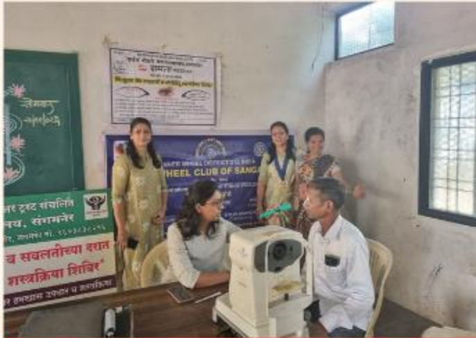
IWC SANGAMNER CONDUCTED EYE CHECKUP CAMP FOR 75 PEOPLE OUT OF THAT 14 CATARACT SURGERY WERE DONE WORTH RS 47,000/-