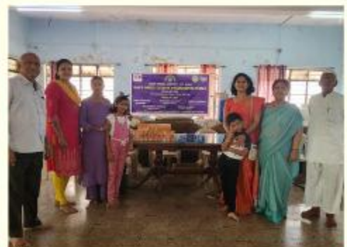
IWC PANDHARPUR PEARLS DONATED TOILET CLEANING ESSENTIALS TO OLD AGE HOME WORTH RS 2028/-