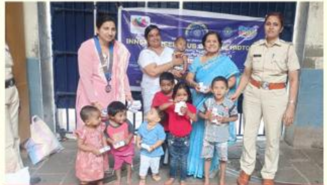
IWC PUNE MIDTOWN DONATED BABY PRODUCTS, RANGOLI ETC AT YERWADA JAIL WORTH RS 3000/-