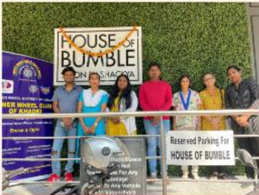
IWC KHADKI CONDUCTED 6- WEEKS SKILL DEVELOPMENT PROGRAM WORTH RS 15000/- TO MAKE 3 TRANSGENDER FINANCIALLY INDEPENDENT