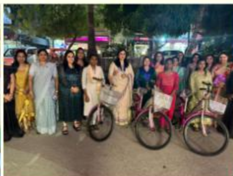
IWC JALNA HORIZON DONATED CYCLES TO 4 NEDDY GIRLS WORTH RS 20,500/-