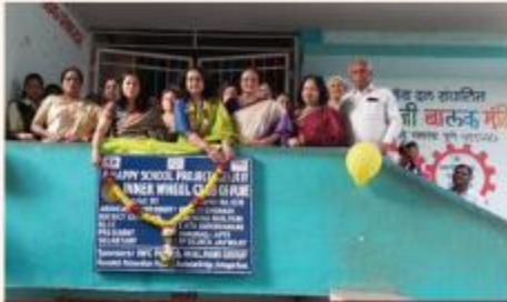
IWC PUNE 81,500/-