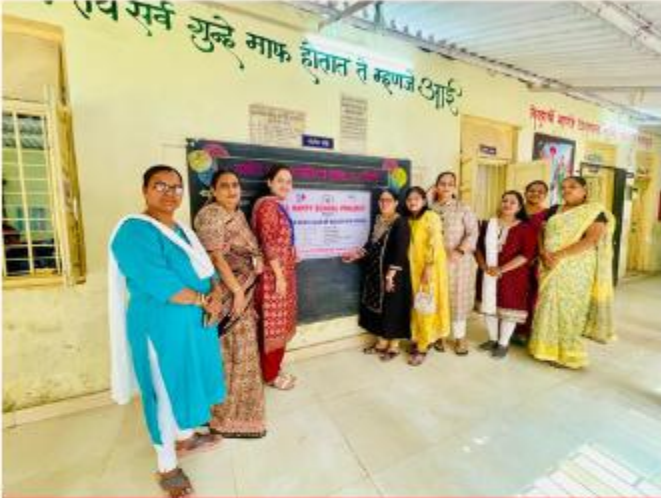
IWC GALAXY NEW PANVEL 2ND SCHOOL -60000/-