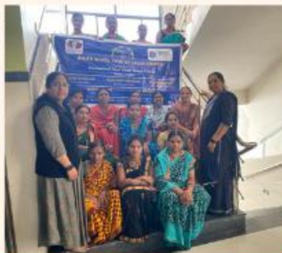
IWC JAINA CENTRAL CONDUCTED ORAL, CERVICAL, BREAST SCREENING CAMP FOR BACHAT GAT LADIES