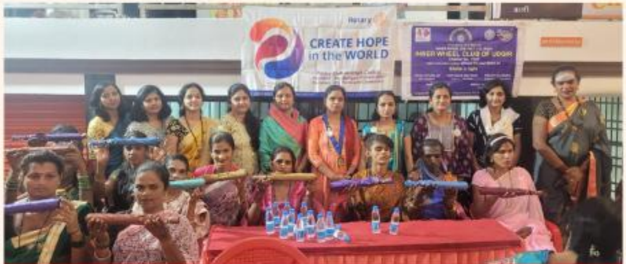
IWC UDGIR DISTRIBUTED UMBRELLA TO TRANSGENDERS WORTH RS 2100/-