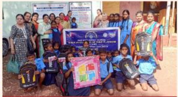
IWC PUNE PLATINUM 3RD SCHOOL - RS 1,16,302/-