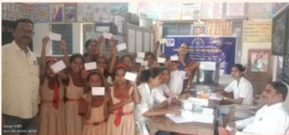
IWC BHOR CONDUCTED BLOOD, HB CHECKUP CAMP FOR 73 GIRLS WORTH RS 1400/-