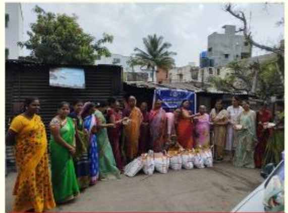
IWC LONAND DISTRIBUTED GROCERIES WORTH RS 7000 TO OLD NEEDY PEOPLE