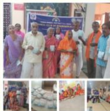
IWC PANDHARPUR PEARLS DONATED GROCERIES TO OLD PEOPLE WORTH RS 3750/-