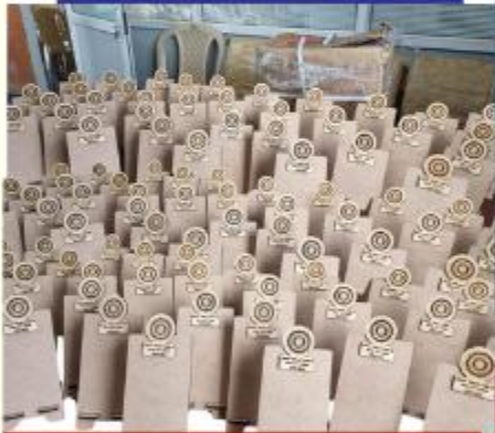
WORTH RS 7500/-