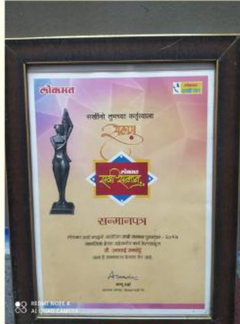
IWC PARLI VAIJNATH