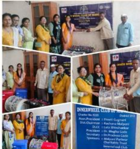
IWC MANCHAR 2ND SCHOOL -RS75,300/-