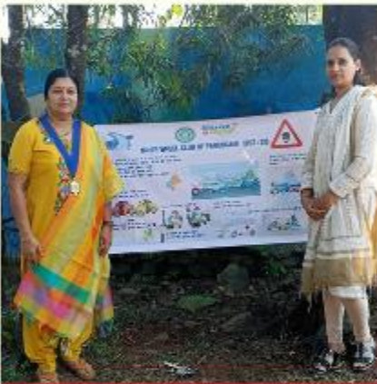
IWC PANCHAGNI PUT 3 HOARDING ON ROAD SAFETY WORTH RS 4500/-