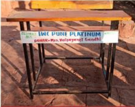
IWC PUNE PLATINUM