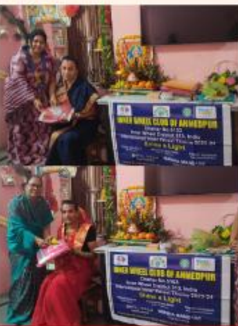
IWC AHMEDPUR FELICITATED TRANSGENDER BY GIVING SAREES WORTH RS 1500/-