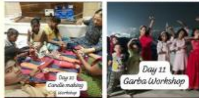
IWC SOLAPUR HARMONY CELEBRATED 11 DAYS WITH DIFFERENT WORKSHOPS ON THE OCCASION OF CHARTER DAY CELEBRATION 8564/-