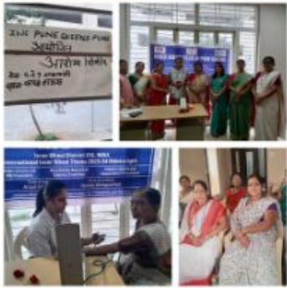
IWC PUNE QUEENS CONDUCTED HEALTH CHECKUP CAMP FOR SENIORS WORTH RS 10,000/-