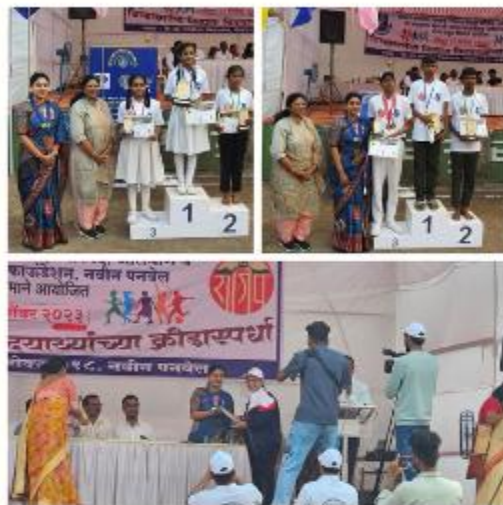
IWC PANVEL INDUSTRIAL TOWN ORGANISED DISTRICT LEVEL SPORTS MEET FOR DISABLED CHILDREN WORTH RS 25000/-