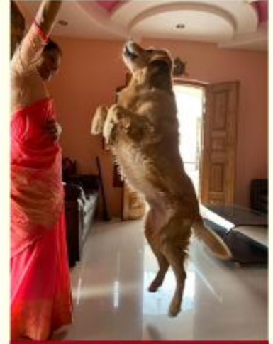
ARCHANA ZODGE IWC BEED