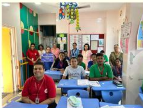
IWC POONA DOWN TOWN DONATED 25000/- FOR EDUCATION OF DIFFERENTLY ABLED CHILDREN