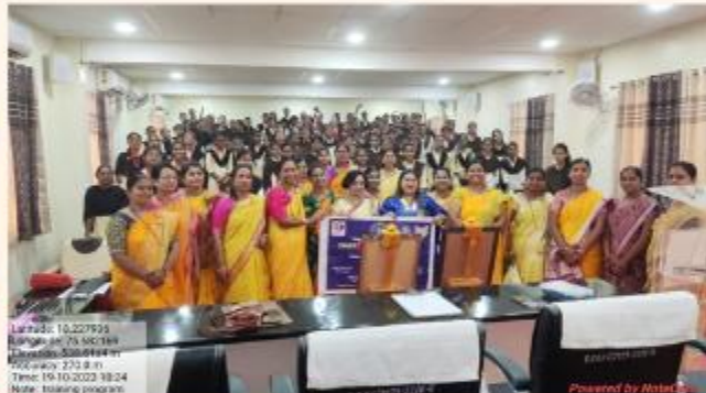
IWC BARSHI ORGANISED MENSTRUAL HYGIENE AND CANCER AWARENESS LECTURE