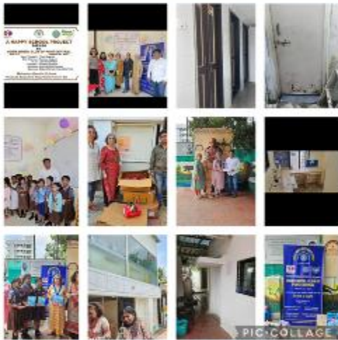
IWC PUNE CENTRAL - RS10,55,205/-