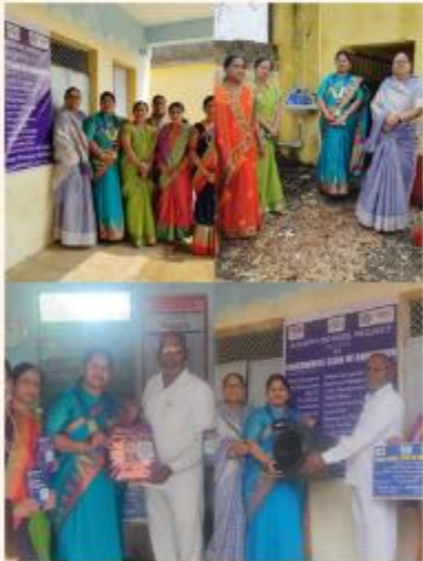
IWC AHMEDPUR- RS 1,00,600/-