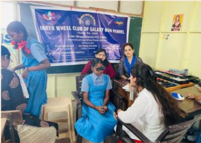
IWC GALAXY OF NEW PANVEL CONDUCTED EYE CHECKUP CAMP FOR 250 STUDENTS, DONATED 25SPECKS, PLANNED 2 SQUINT SURGERY AND 1 CATARACT SURGERY WORTH RS 2,50,000/-