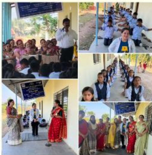
IWC KARAD SANGAM ORGANISED PERSONALITY DEVELOPMENT WORKSHOP FOR 110 STUDENTS