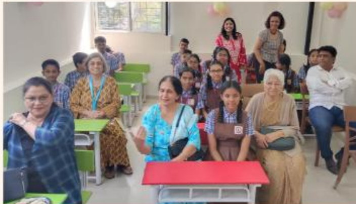
IWC PUNE CENTRAL - RS 10,55,205/-