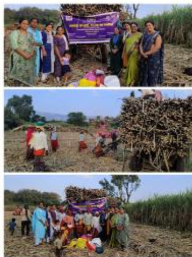
IWC PATAN DISTRIBUTED CLOTHS TO NEDDY FARMERS WORTH RS 1500/-