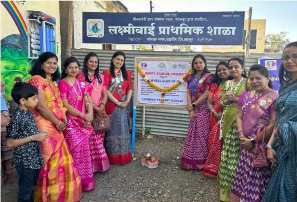
IWC UDGIR -RS 76000/-