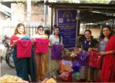
IWC SHRIRAMPUR DONATED CLOTH BAGS WORTH RS 6250/- TO VEGETABLE VENDORS