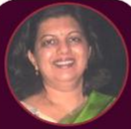
PDC SALYEE KHANDESHE 14th dec