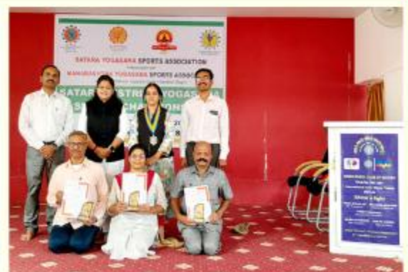
IWC SATARA CONDUCTED YOGA COMPETITION