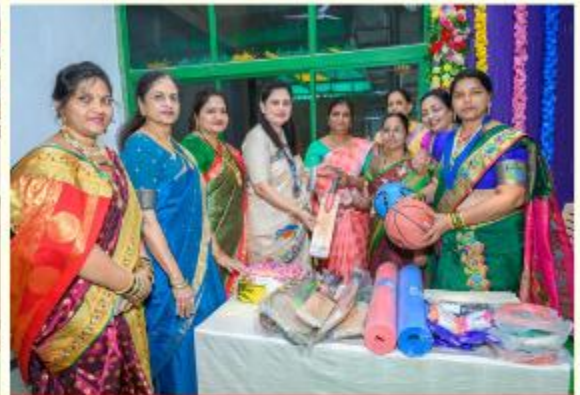
IWC JALNA DONATED SPORTS ITEM WORTH RS 11,000/-