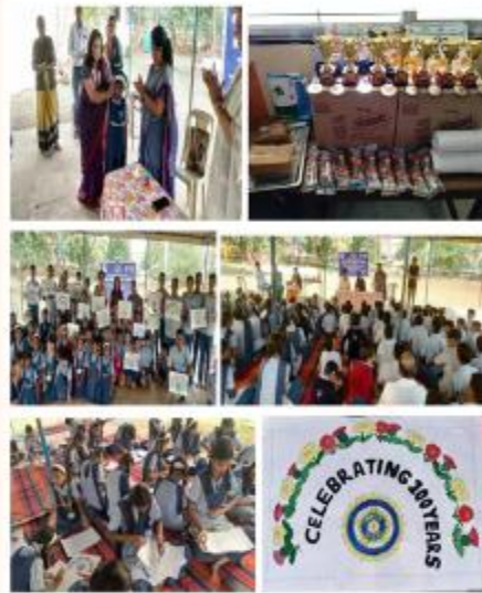
IWC PIMPRI ORGANISED DRAWING COMPETITION AND DONATED HEARING AIDS TOO WORTH RS 14,290/-