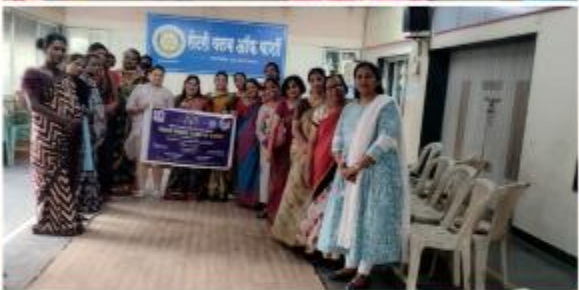
IWC BARSHI ARRANGED TOTAL BLOOD COUNT, HB, THYROID TEST WITH SAREE DISTRIBUTION FOR TRANSGENDER WORTH RS 5700/-