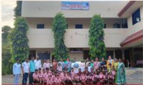
IWC KALLAMB 41,500/-