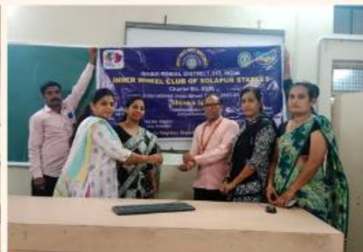
IWC SOLAPUR STARLET DONATED 5000/- FOR KIDNEY TRANSPLANT SURGERY.