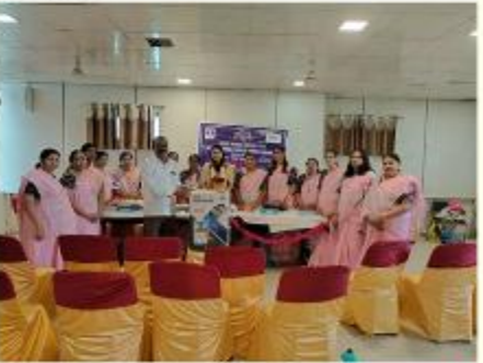
IWC PARLI VAJNATH