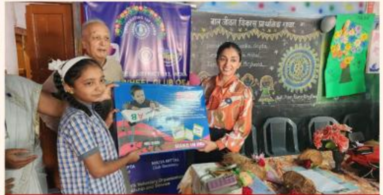
PUNE RIVER RHYTHMS - RS 1,05,100/-