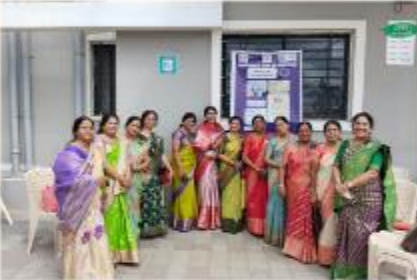
IWC AHMEDPUR STARTED COLLECTING MILK BAGS AND SENT IT TO RECYCLE