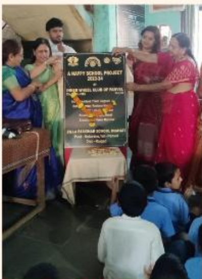
IWC PANVEL -RS 82,595/-