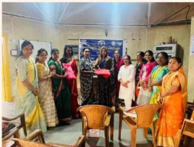
IWC KOREGAON CELEBRATED BIRTHDAY OF 2 TRANSGENDERS