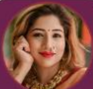
PRE SWATI BARGE 11 Dec IWC Koregaon