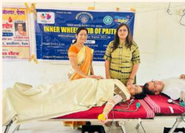
IWC PAITHAN CONDUCTED BLOOD DONATION CAMP