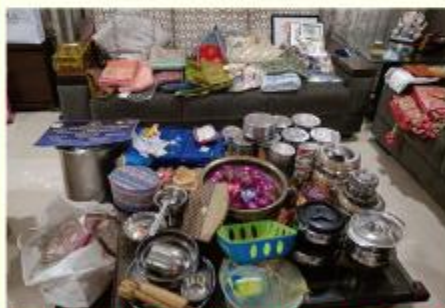
IWC PUNE RIVERSIDE DONATED ESSENTIALS ITEMS TO BLIND COUPLE'S DAUGHTER MARRIAGE WORTH RS 45,000/-