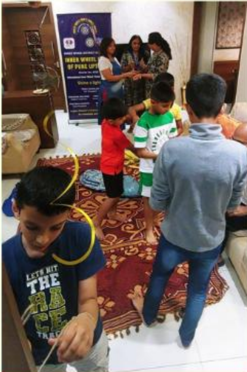
IWC PUNE UPTOWN CONDUCTED TOPOLOGICAL THINKING SESSION FOR CHILDREN WORTH RS 2650/-