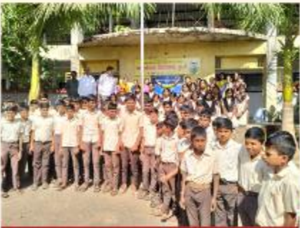
IWC NIGDI PRIDE - 1,36,512/-