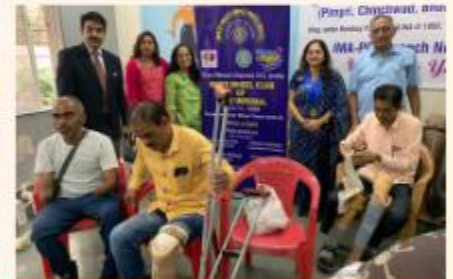
IWC PUNE IMPERIAL DONATED JAIPUR FOOT WORTH RS 25,000/-