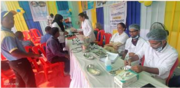
IWC PANVEL CITY CONDUCTED EYE AND DENTAL CHECKUP CAMP FOR 100 TRUCK DRIVERS