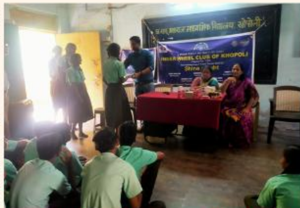
IWC KHOPOLI CONDUCTED PHYSICAL CHECKUP CAMP OF 130 STUDENTS WORTH RS 3800/-