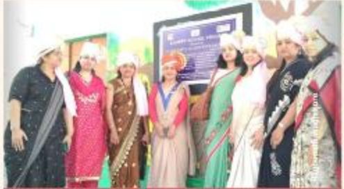
IWC PUNE DEFFODILS - RS 1,35,000/-