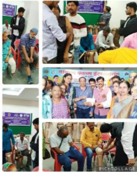
IWC BANER HILLS DONATED 60 JAIPUR FOOT WORTH RS 1,50,000/-