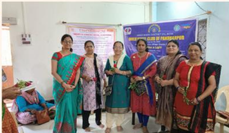
IWC PANDHARPUR CONDUCTED DENTAL CHECKUP AT SCHOOL