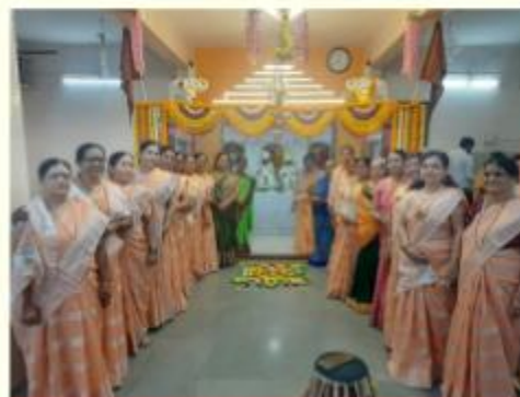
IWC PUNE WINGS CELEBRATED TRIPURARI POORNIMA