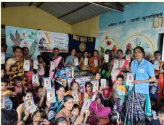
IWC MAHABLESHWAR GAVE COOKING GAS SAFETY INSTRUCTIONS TO NEEDY WOMEN