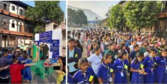
IWC SATARA CAMP ARRANGED "PLOGATHON" WITH THE PARTICIPATION OF 243 PEOPLE, WORTH RS 18000/-