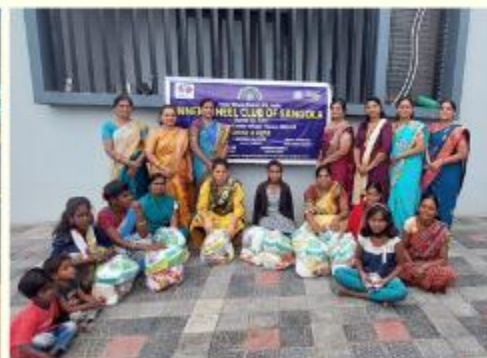
IWC SANGOLA DONATED GROCERIES TO LESS FORTUNATE PEOPLE