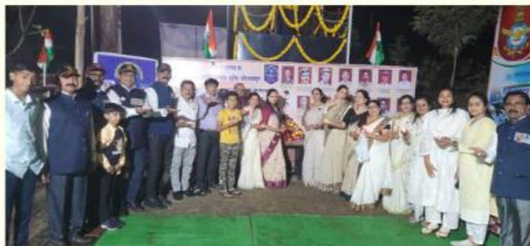
IWC SHRIRAMPUR ORGANISED CULTURAL PROGRAMME ON "EK DIYA- SHAHIDO KE NAAM "