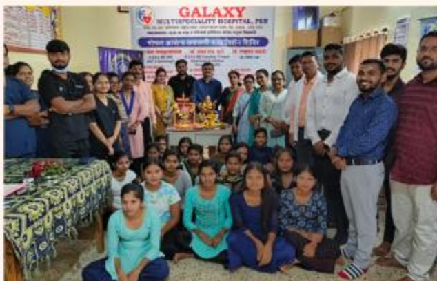
IWC PEN ORGANISED FULL BODY CHECKUP FOR 70 PEOPLE