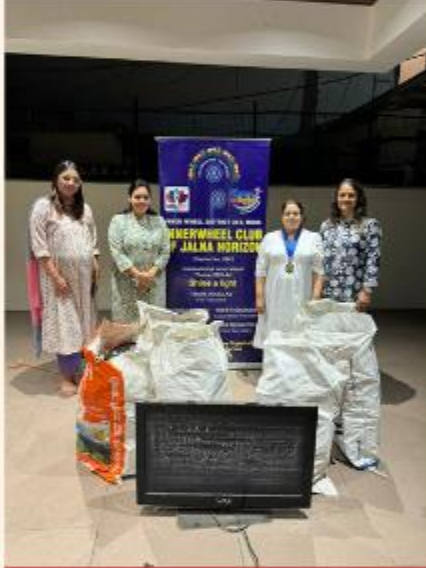
IWC JALNA HORIZON COLLECTED 200 KG E- WASTE AND SENT IT FOR RECYCLE