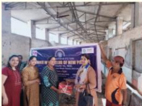
IWC NEW PANVEL DONATED FANS TO GAU SHALA WORTH RS 10,000/-